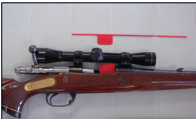
Shown with Bolt in