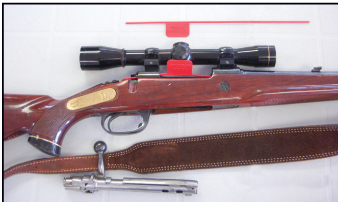
Shown with Bolt out